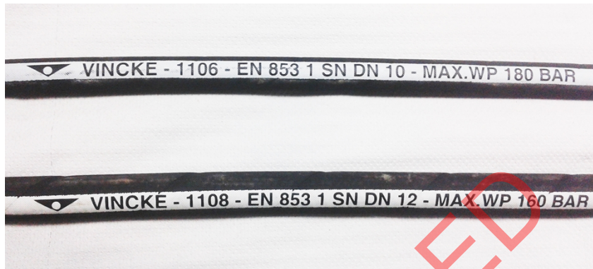
Fig.1 - Hose marking - See 'VINCKE' and hose type number: 1106 for 3/8" hose and 1108 for 1/2" hose