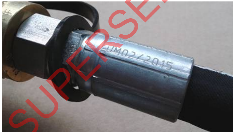
Fig.2 - Example of date of manufacture engraved on the hose fitting (UMmm/yyyy)

NOTE: The SB is NOT applicable to vapour hoses.